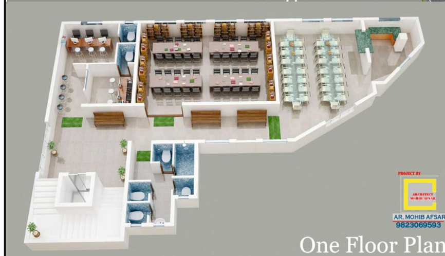
One Floor Plan