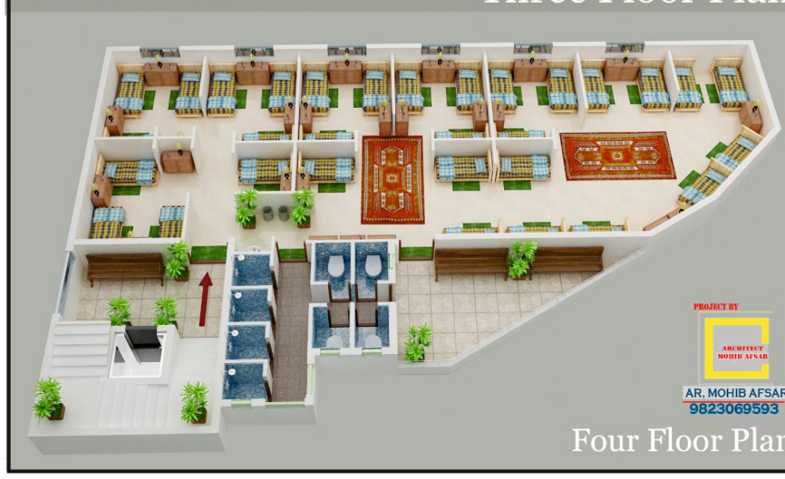
Four Floor Plan