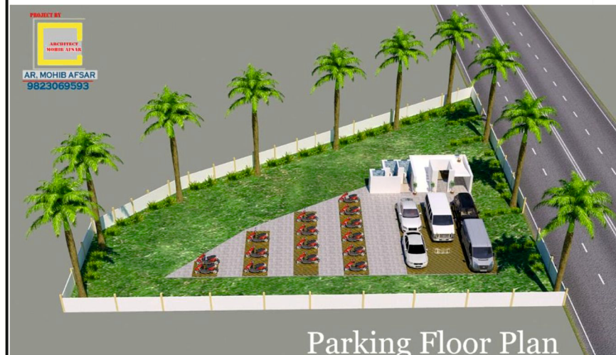
Parking Floor Plan