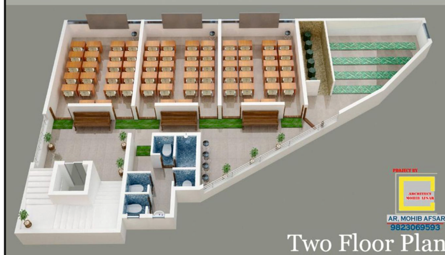
Two Floor Plan