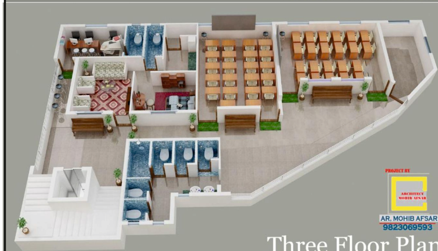
Three Floor Plan